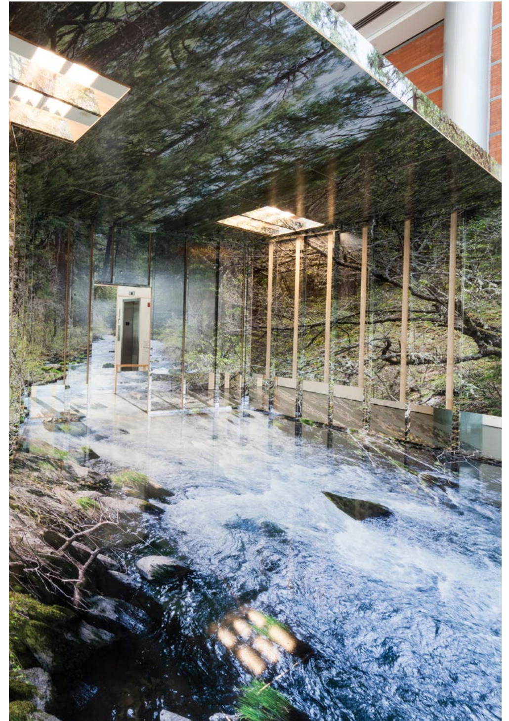
Containment , 2018 Sight-specific installation Approximately 131 x 304 x 493 inches Photo by Tony Walsh

Chris Engman, Refraction , 2018. Digital Pigment Print, 43 x 55½ inches. Courtesy of the artist and Luis De Jesus Los Angeles