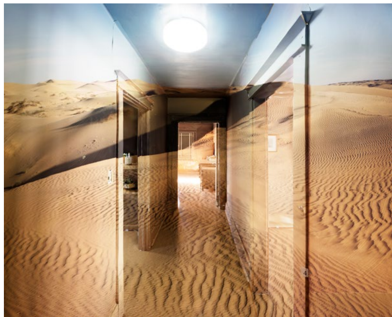
Landscape for Quentin, 2017 Digital Pigment Prints 43 x 55½ inches