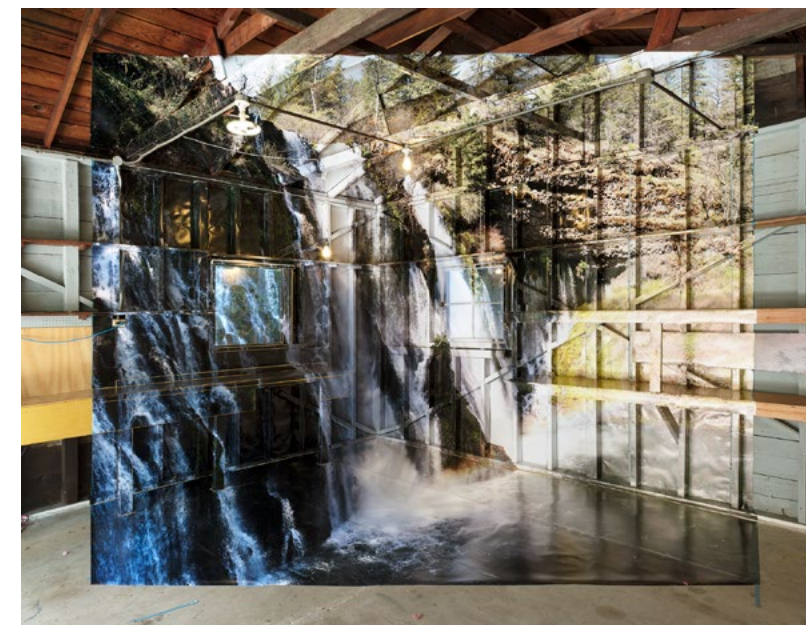
Refraction, 2018 Digital Pigment Print 43 x 55½ inches