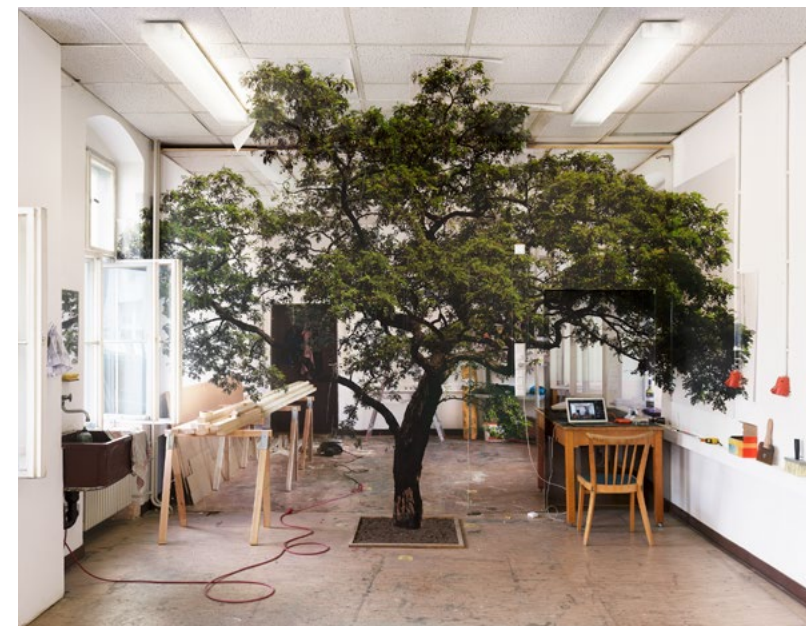
Landscape for Candace , 2015 Digital Pigment Print 43 x 55½ inches