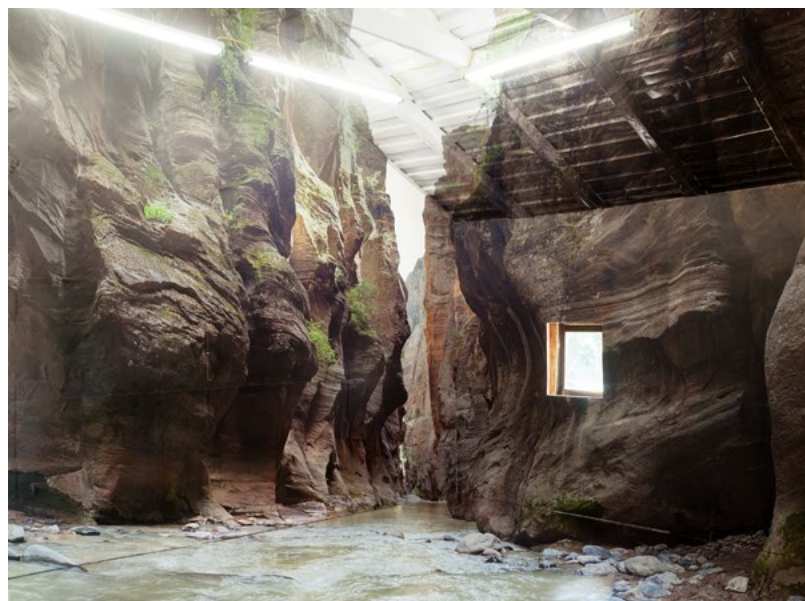
Containment , 2015 Digital Pigment Print 43 x 58 inches