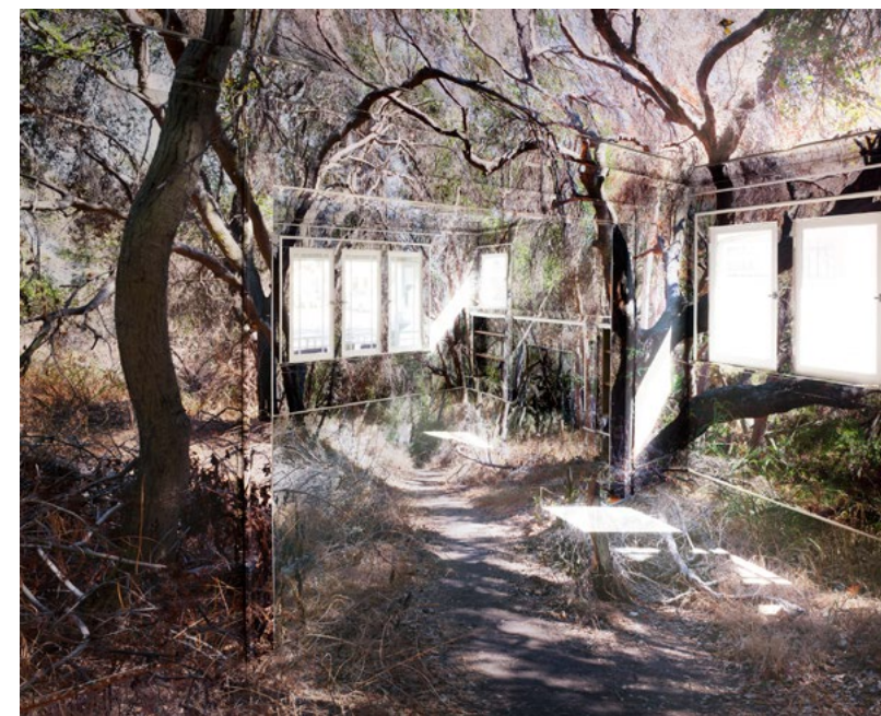
Refuge , 2016 Digital Pigment Print 43 x 53 inches