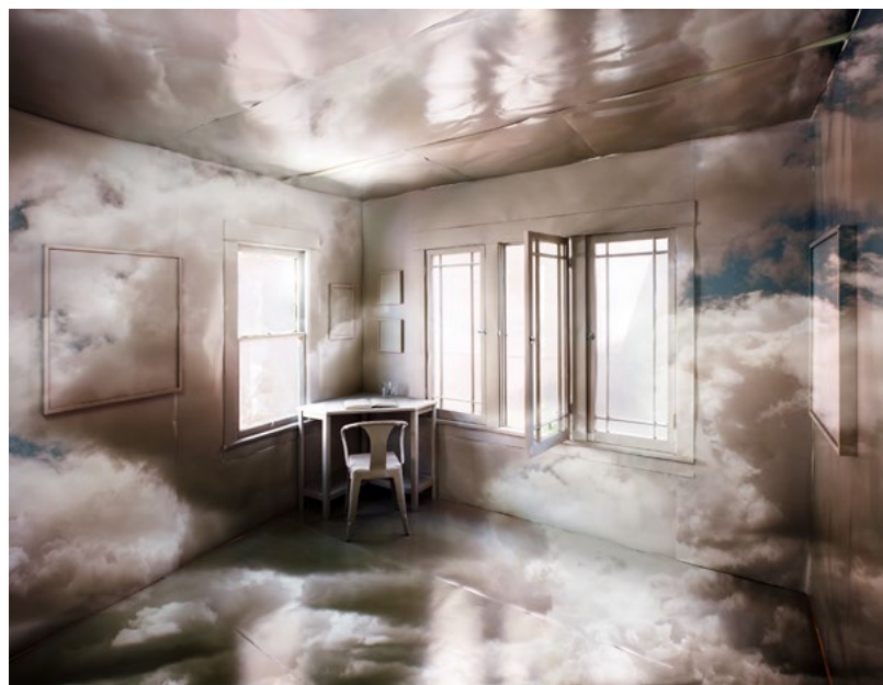
Equivalence, 2017 Digital Pigment Print 43 x 55½ inches